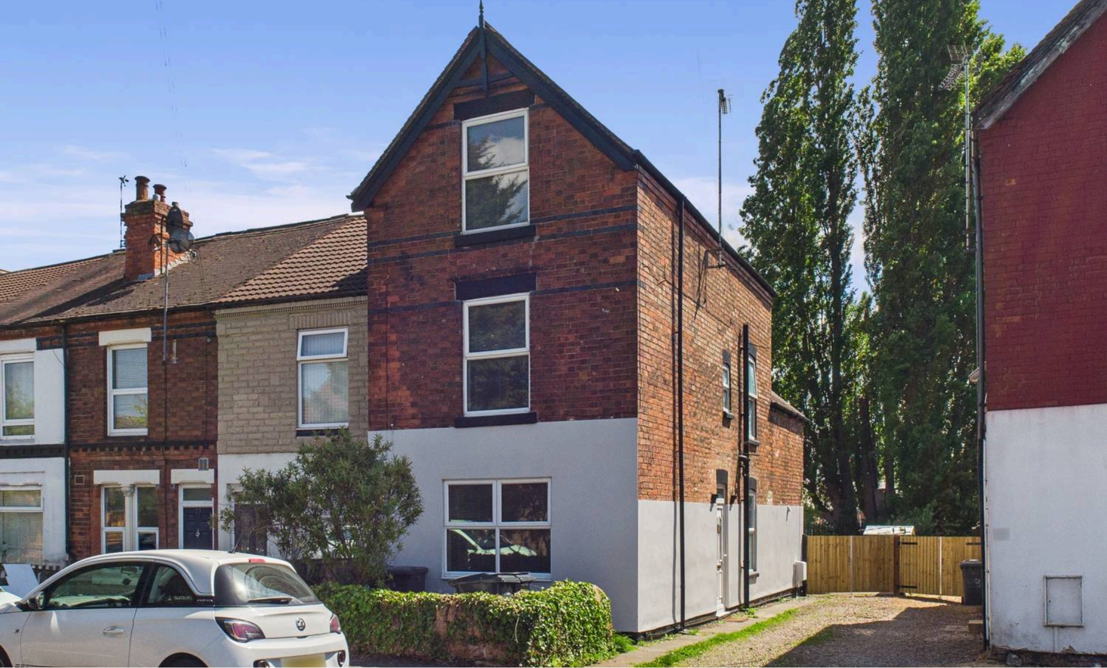
31 Vale Road, Colwick – NG4 2GL £265,000