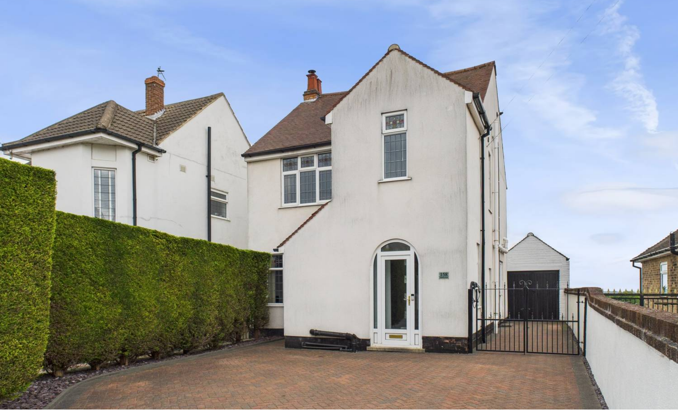
158 Oakdale Road, Carlton - NG4 1AH Guide Price £450,000