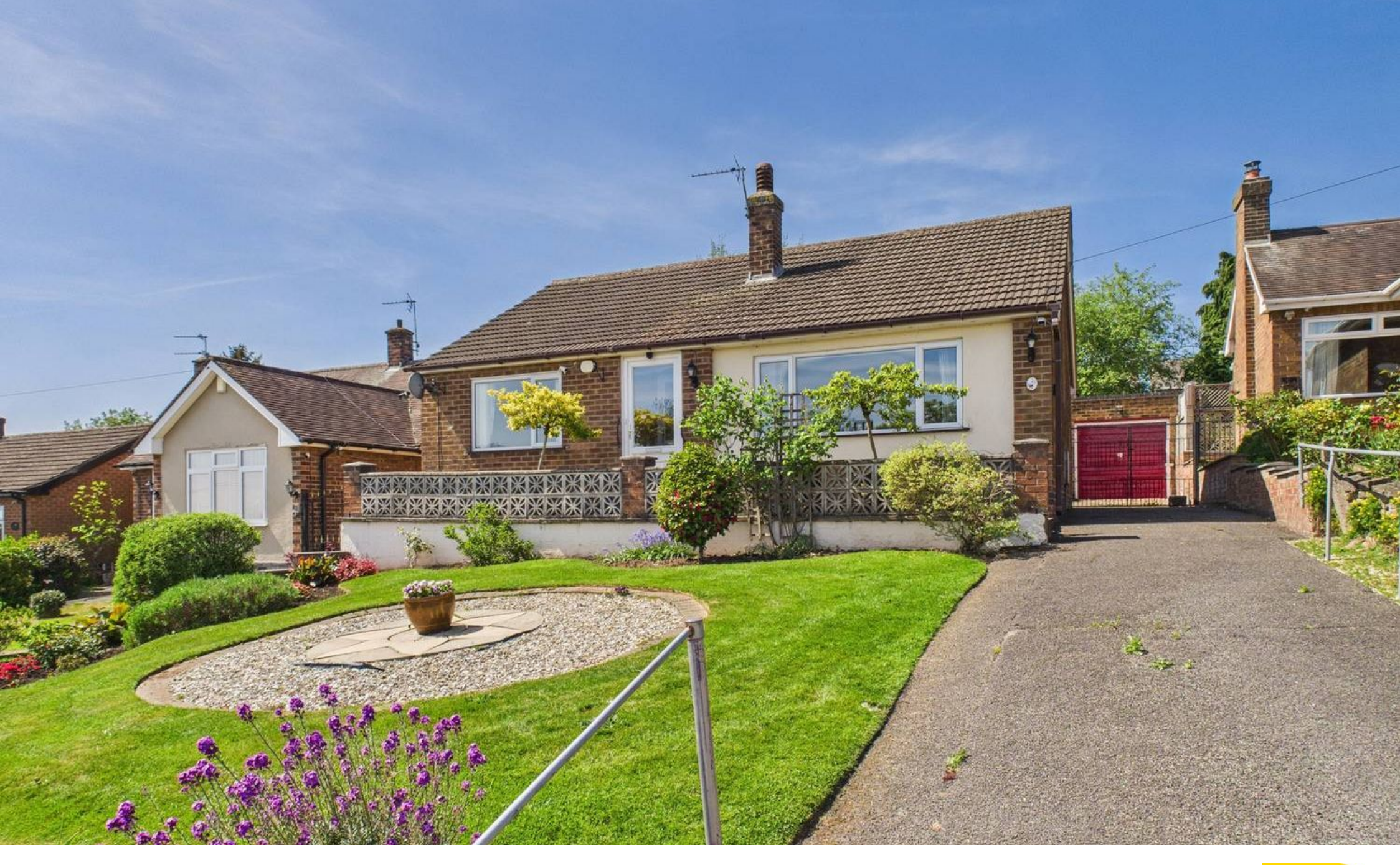
45 Hillview Road, Carlton - NG4 1LB Guide Price £270,000