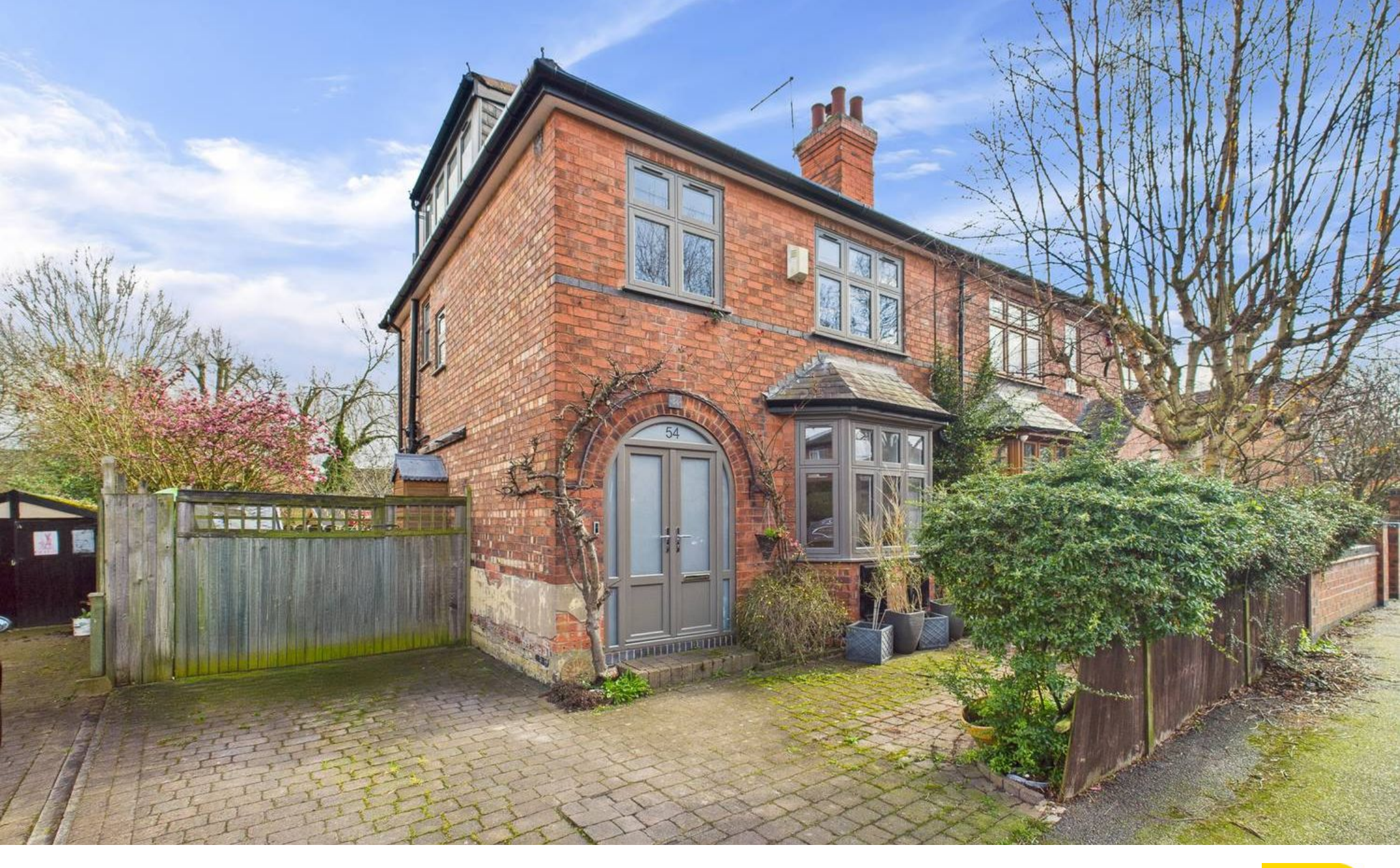
54 Vernon Avenue, Carlton, Nottingham, NG4 3FX Guide Price £325,000