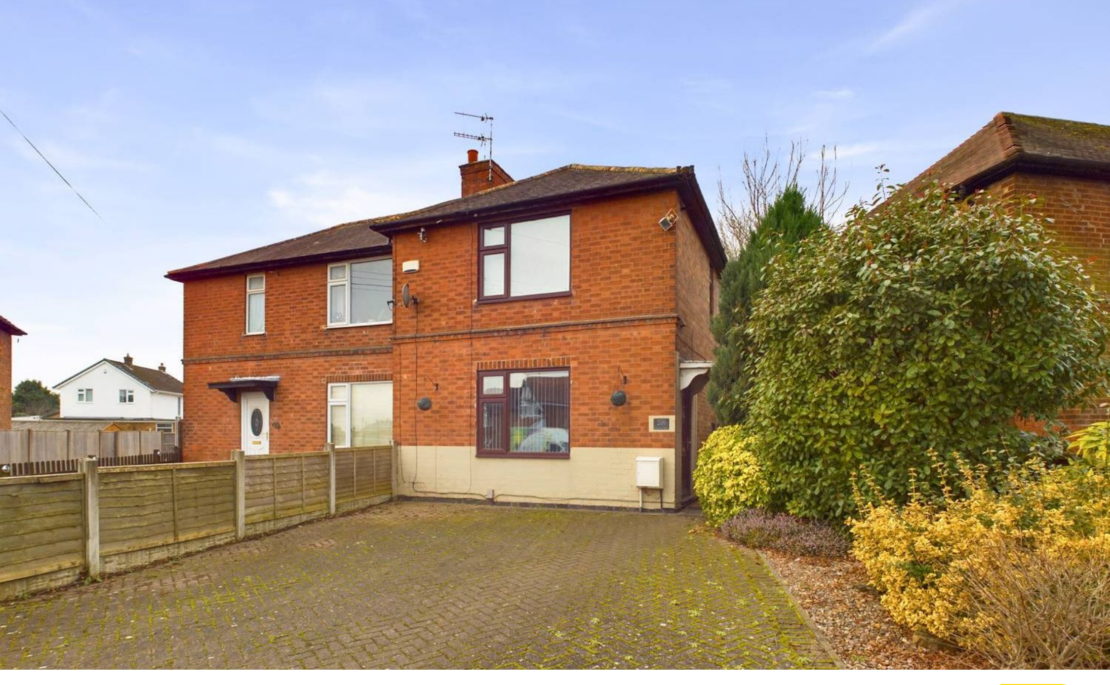
209 Cavendish Road, Carlton - NG4 3SA Guide Price £190,000