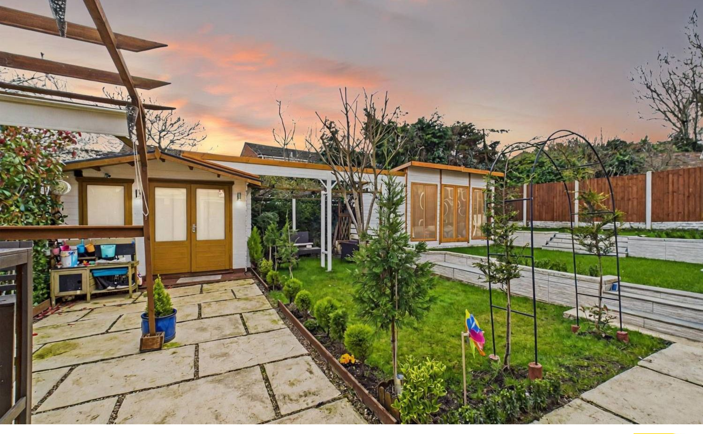
71 Thorneywood Rise, Nottingham - NG3 2PE Guide Price £260,000