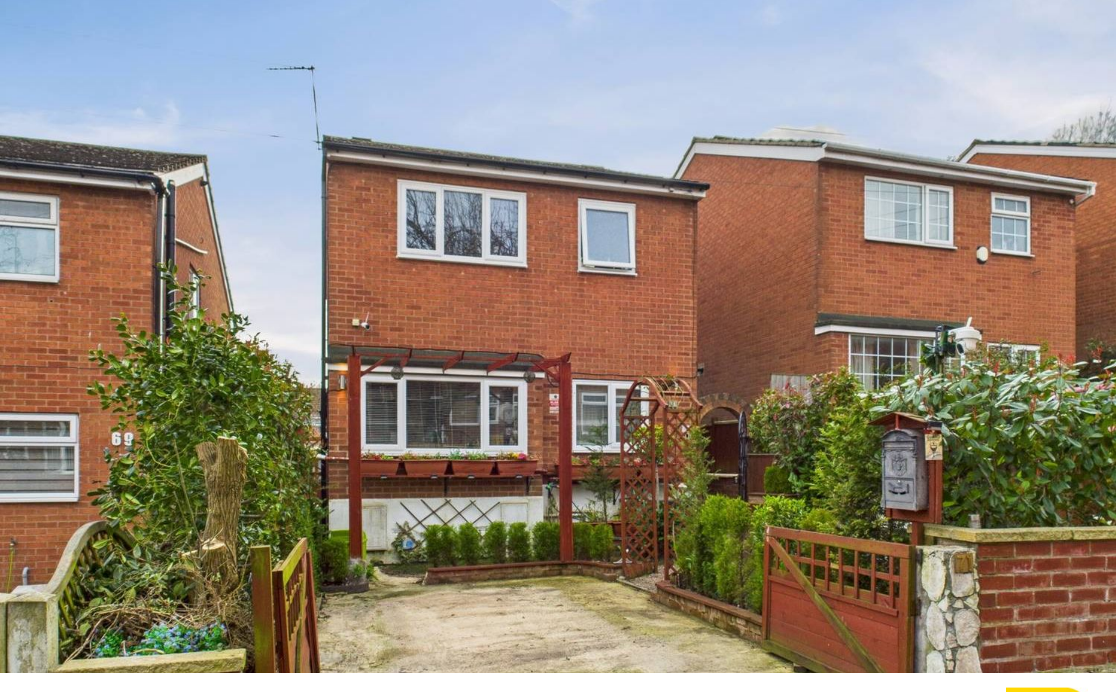
71 Thorneywood Rise, Nottingham - NG3 2PE Guide Price £300,000 - £325,000