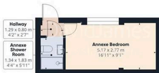
Floor 0 Building 2