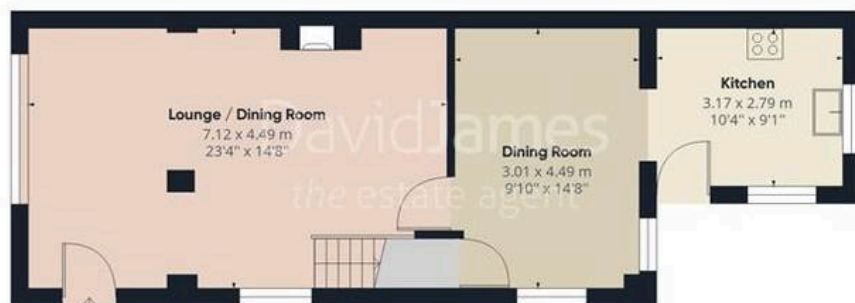
Floor 0 Building 1