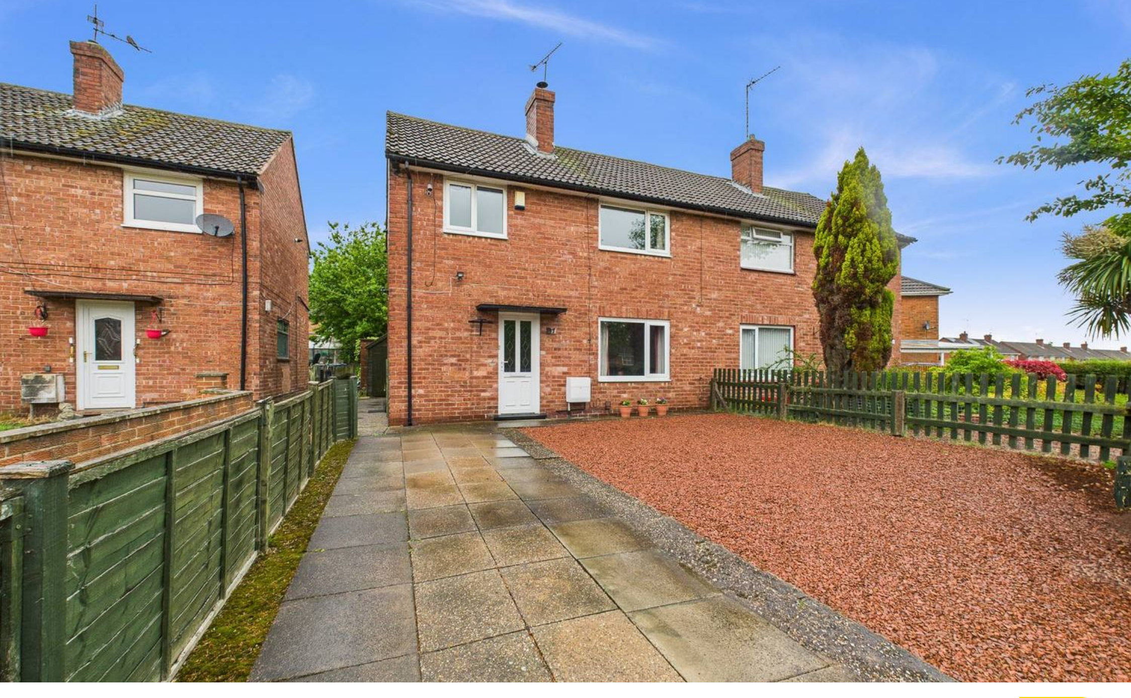
17 Holt Grove, Calverton - NG14 6HW Guide Price £230,000