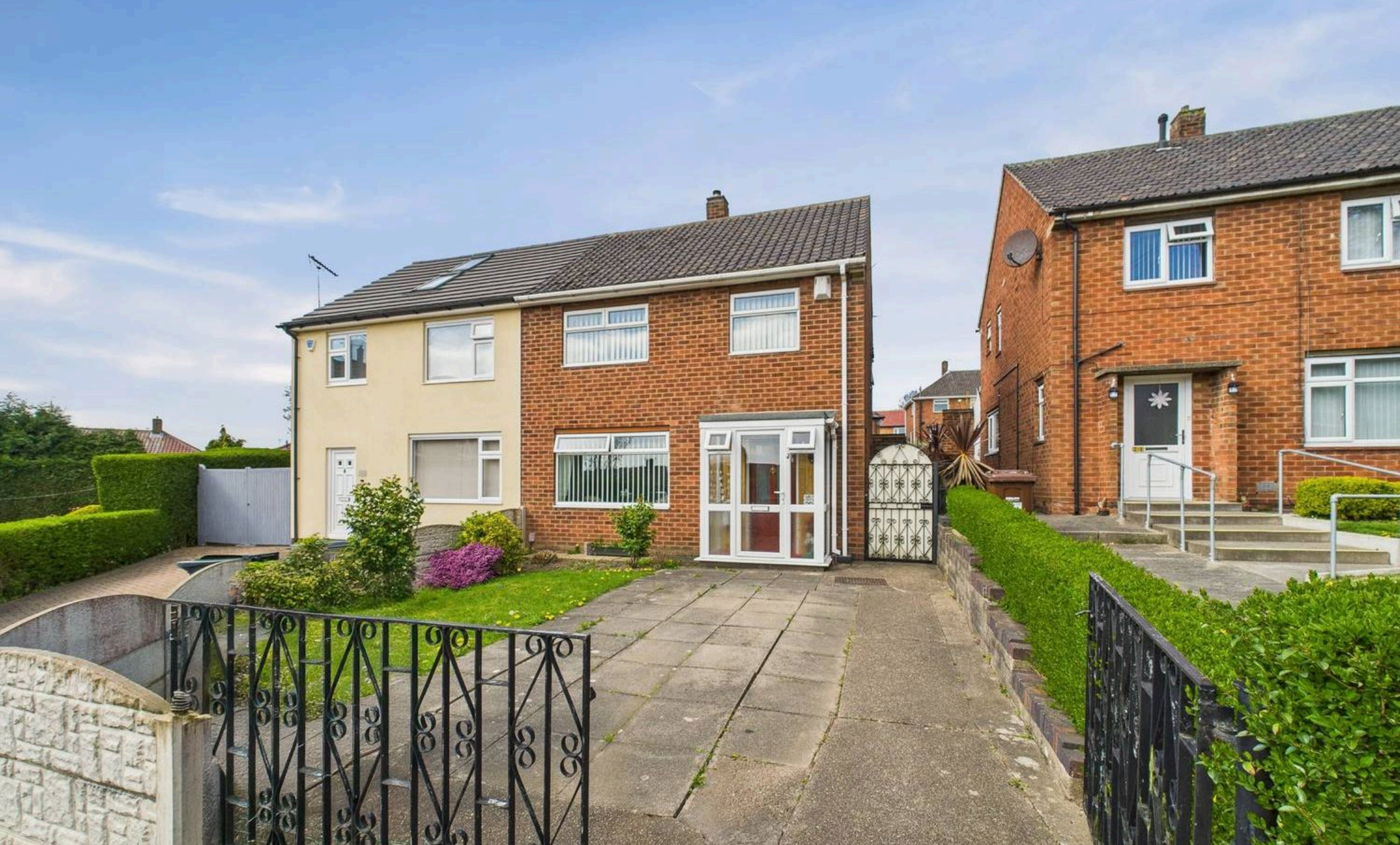
20 Elm Grove, Arnold – NG5 8BN £215,000