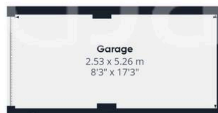
Floor 0 Building 2