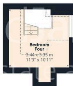
Floor 2 Building 1