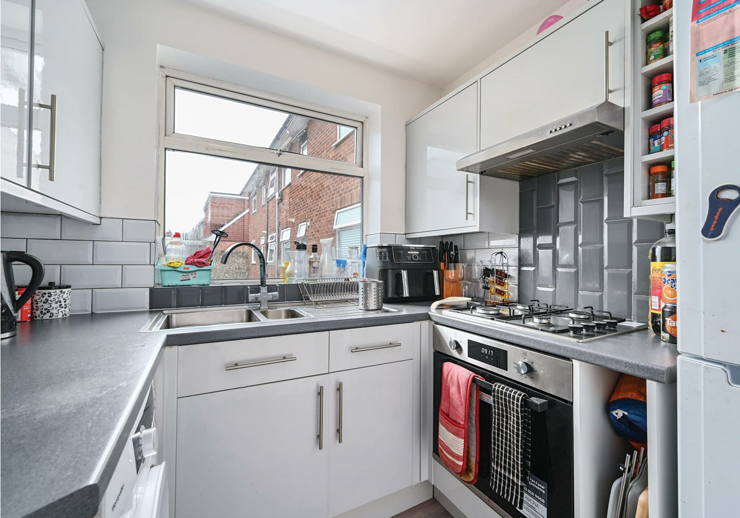
Mile Oak Road, BN41 Approximate Gross Internal Area = 45 sq m / 485 sq ft

Service Charge: approximately £1900 per annum, paid in two half yearly instalments which includes the buildings insurance. There is no Ground Rent charge Council Tax Band B