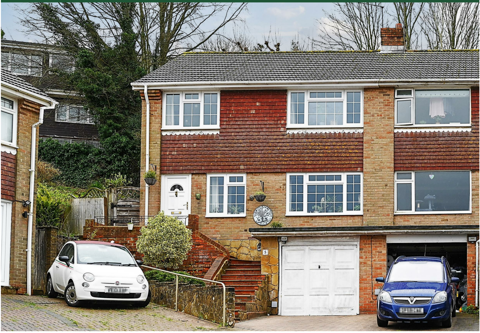
Southon Close, Portslade, BN41 2RX Offers In Excess Of £400,000 Freehold