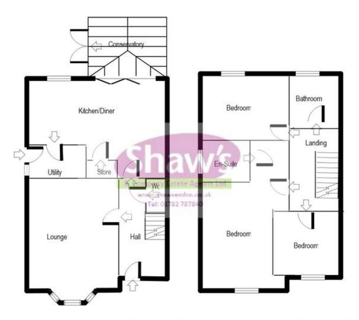
Whilst every attempt has been made to ensure the accuracy of the floor plan contained here, measurements of doors, windows, rooms and any other items are approximate and no responsibility is taken for any error, omission, or mis-statement and the floor plan is an illustration only as a guide. This plan is for illustrative purposes only and should be used as such by any prospective purchase and the purpose of the properties of the prospective purposes only and should be used as such by any prospective purchase and the properties of the services, systems, appliances, shown have not been tested and no guarantee as to their operation or efficiency can be given Made with 1 visual Builder