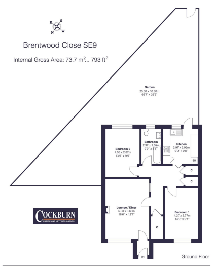
This plan is for layout guidance only and not drawn to scale unless stated. Window and door openings are approxim. Whilst every care is taken in the properation of this plan, we would advise intensited parties to check all dimension.