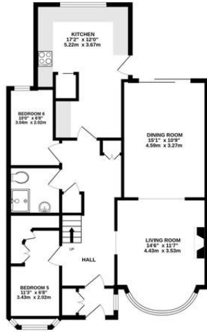
GROUND FLOOR 856 sq.ft. (79.4 sq.m.) approx.