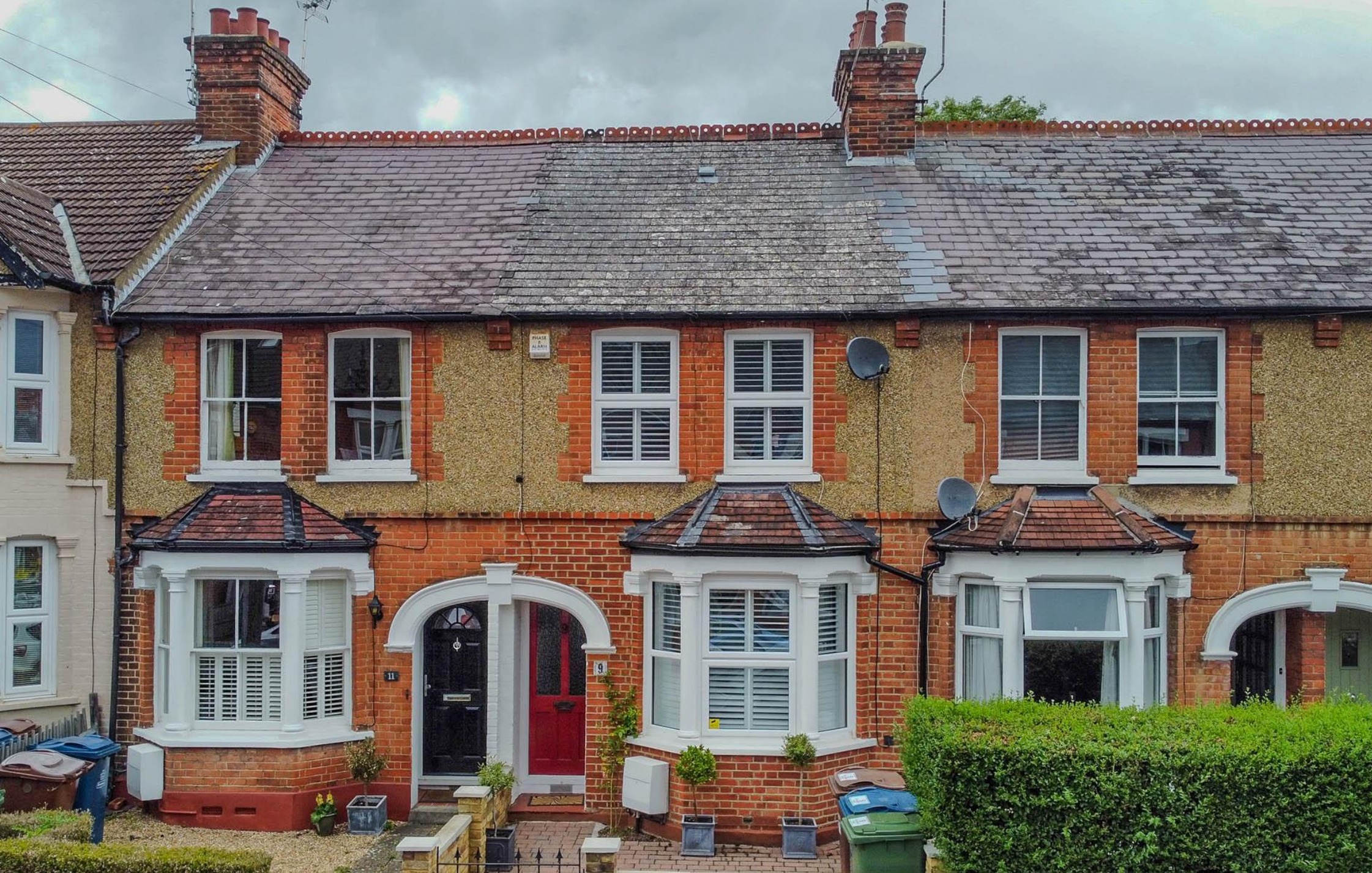
KINGSLEY ROAD, PINNERS HA5 5RB