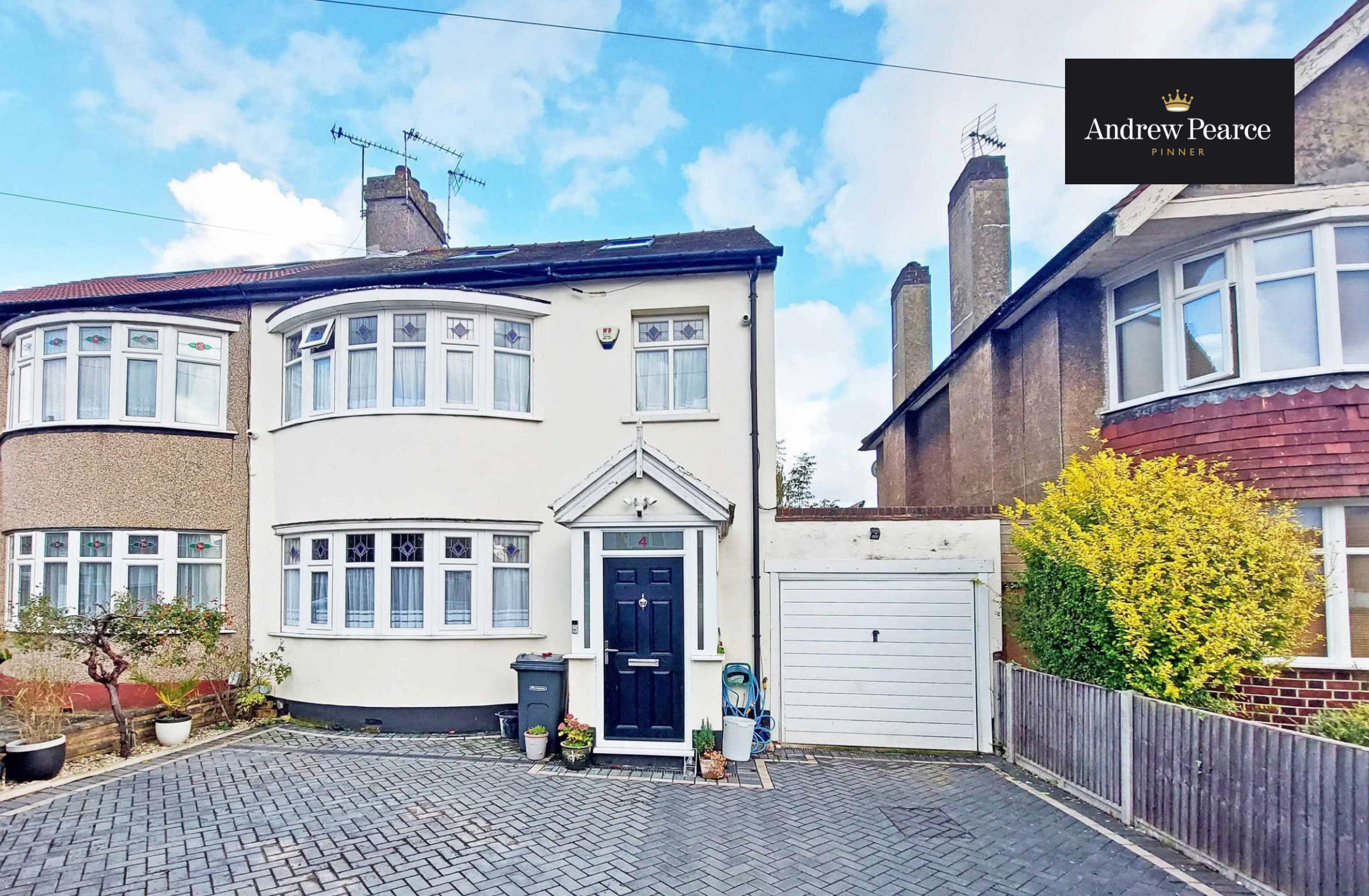
THE AVENUE, PINNER, MIDDLESEX, HA5 5BL £830,000