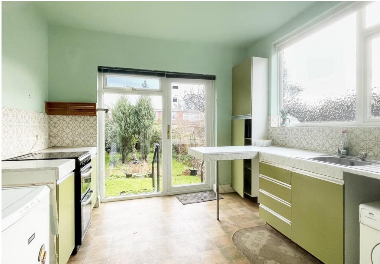
A traditional 'Cutler' built three bedroom semi-detached family home in need of modernisation to unlock its full potential. Chain free.