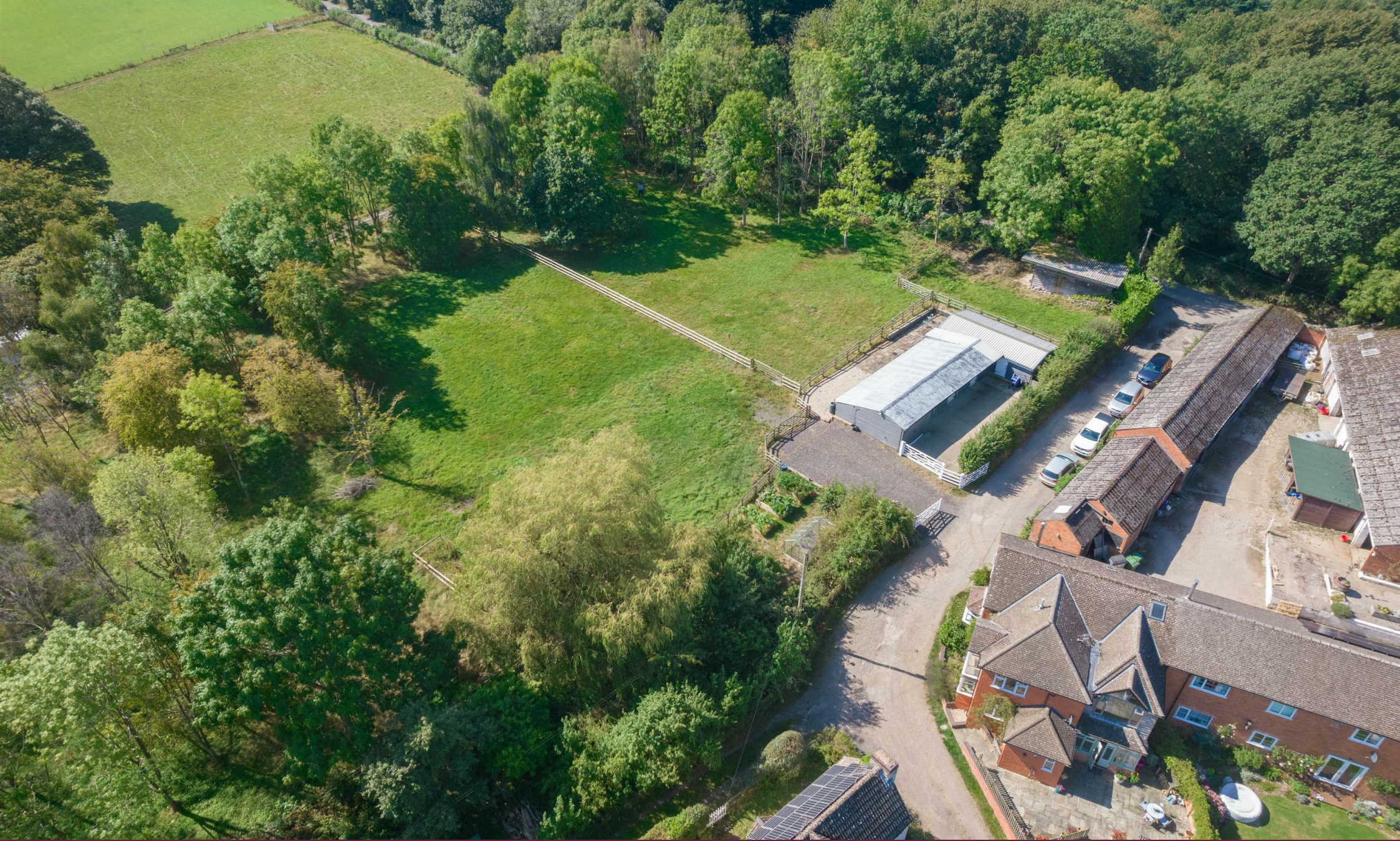
Bay Tree Cottage, Storridge, WR13 5EZ