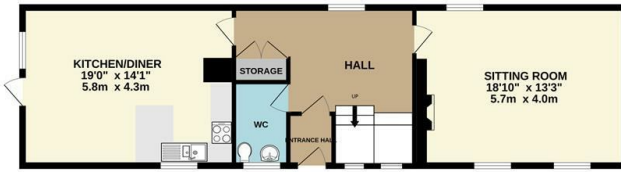
GROUND FLOOR 747 sq.ft. (69.4 sq.m.) approx.