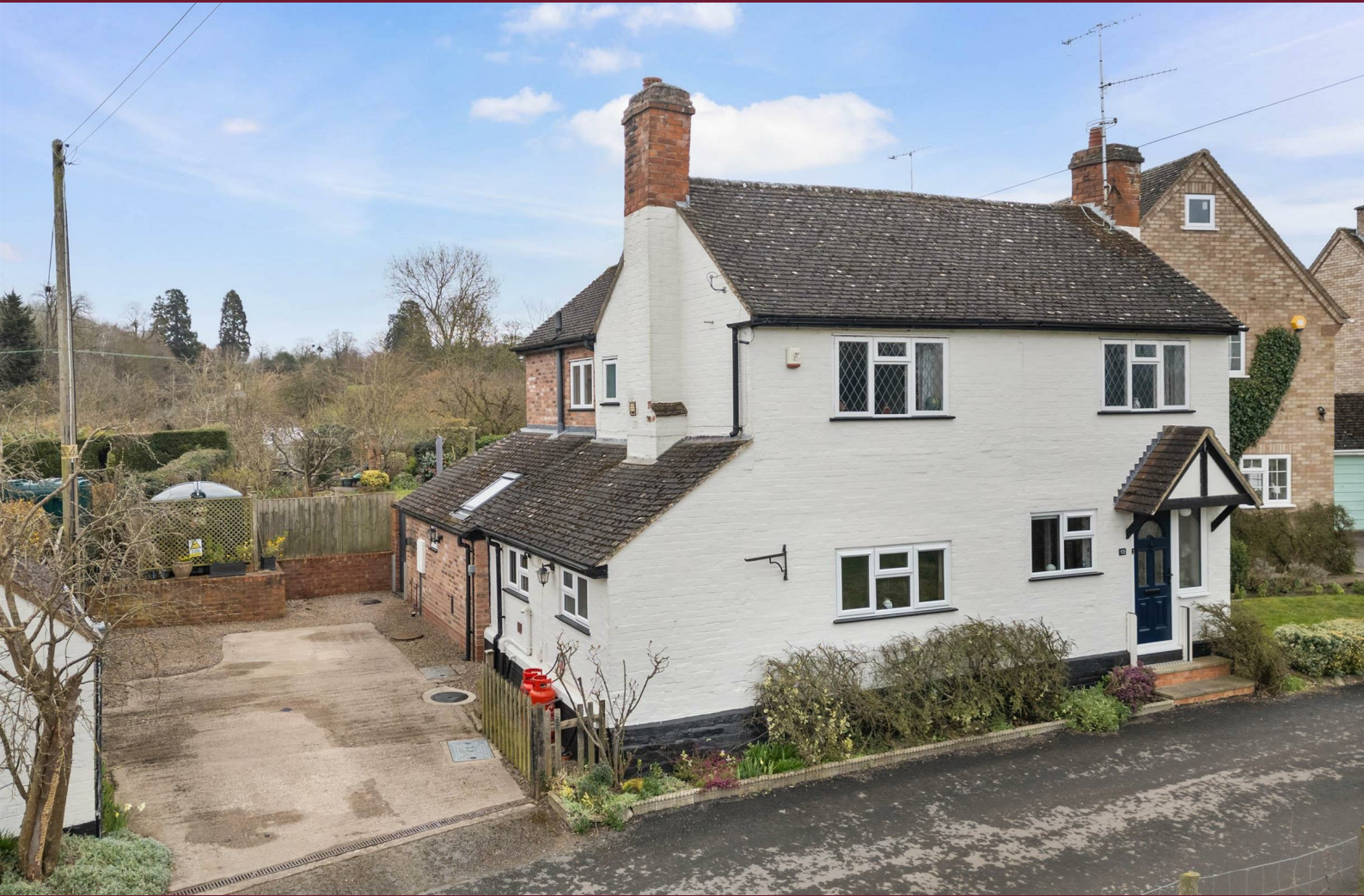
13 Church Lane, Severn Stoke, WR8 9JQ