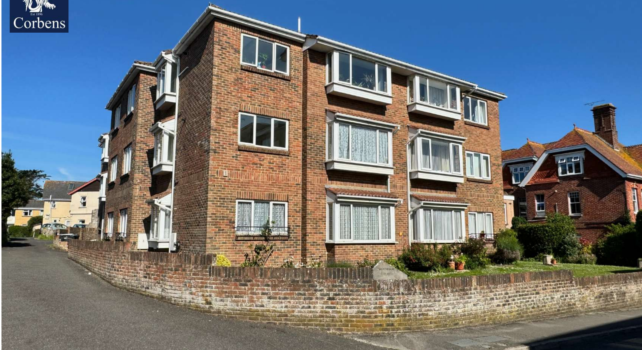
6 DAVENHAM COURT, ILMINSTER ROAD, SWANAGE £239,950 Shared Freehold - No Forward Chain