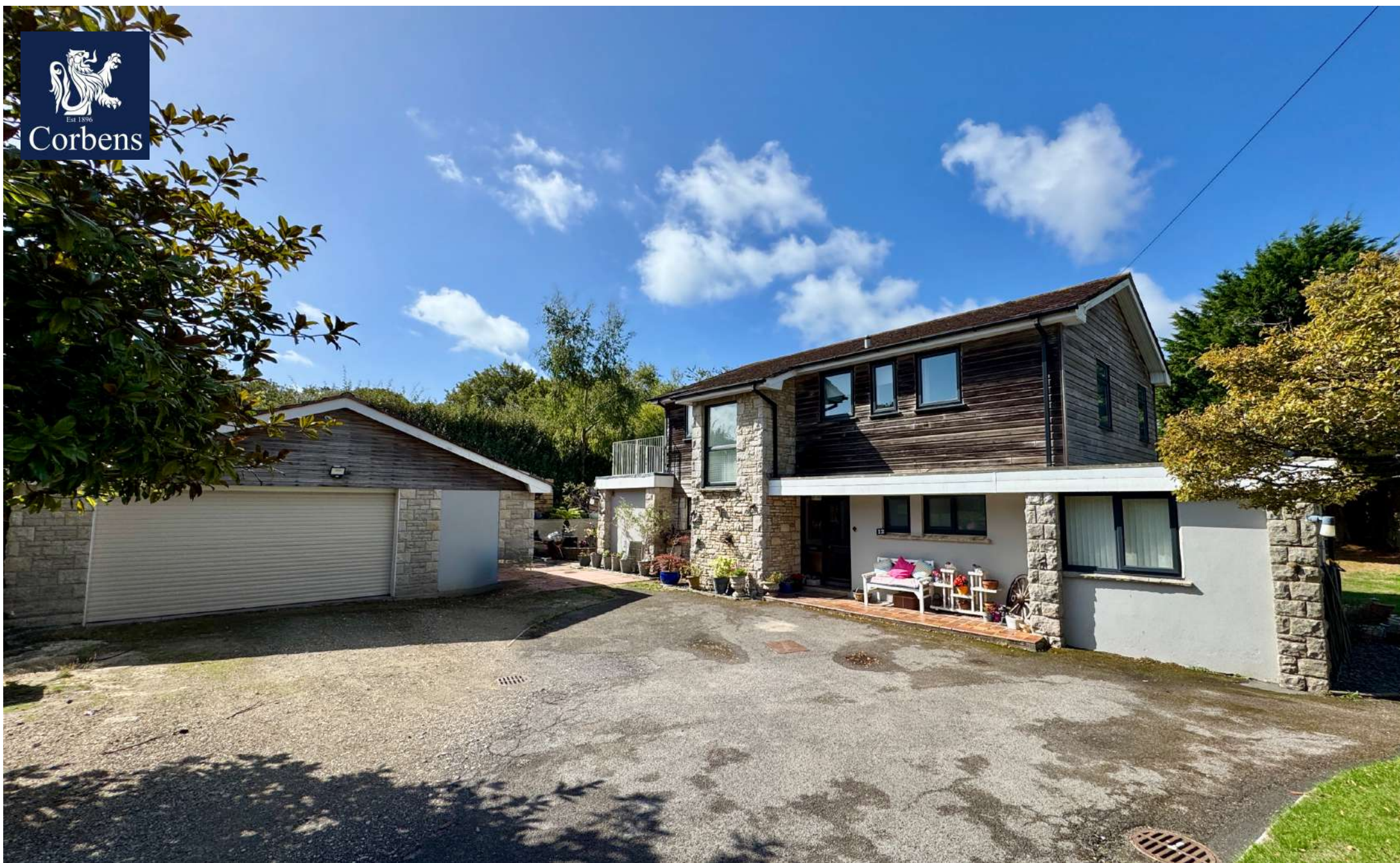
12 BON ACCORD ROAD, SWANAGE £1,250,000 Freehold