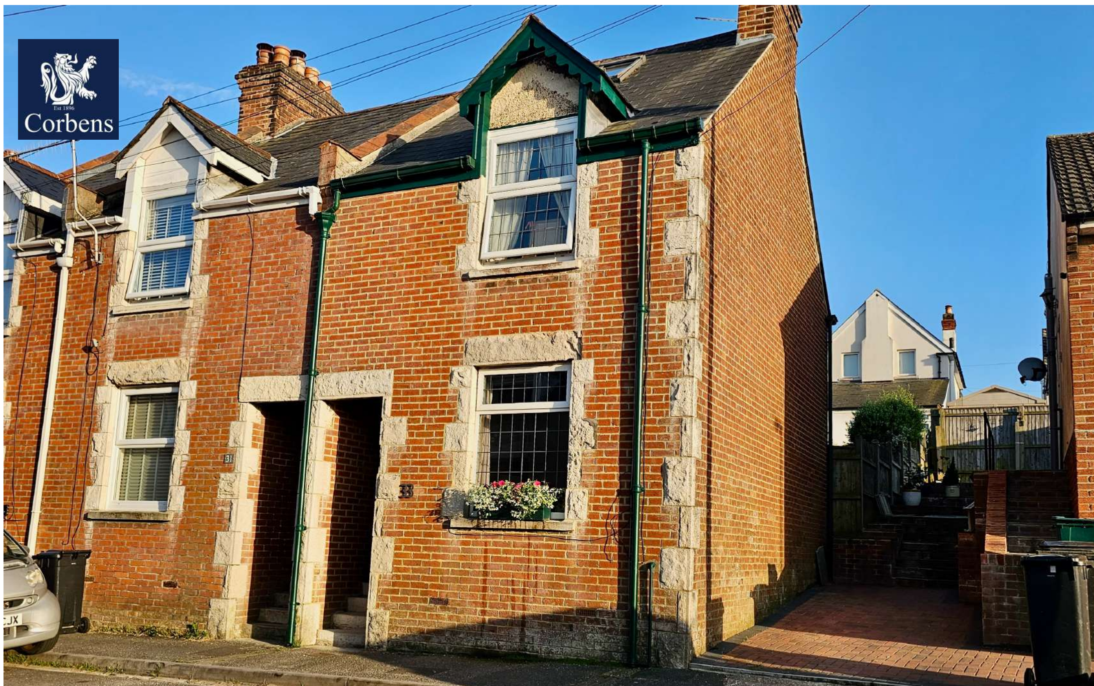
33 RICHMOND ROAD, SWANAGE £399,950 Freehold