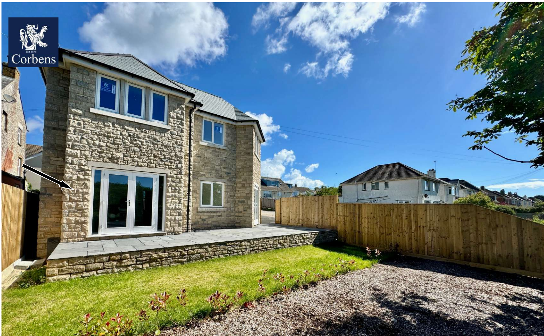
FLAT 1 SCOTT'S HOUSE, PROSPECT CRESCENT, SWANAGE £324,950 Shared Freehold