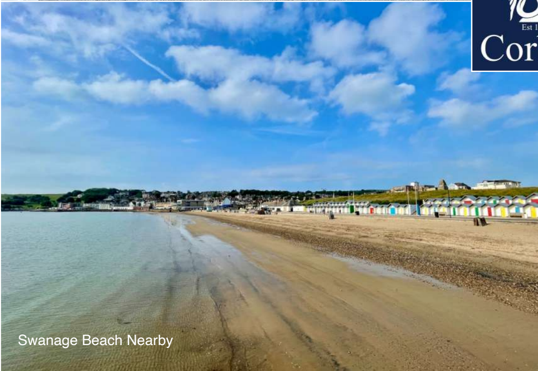
Swanage Beach Nearby