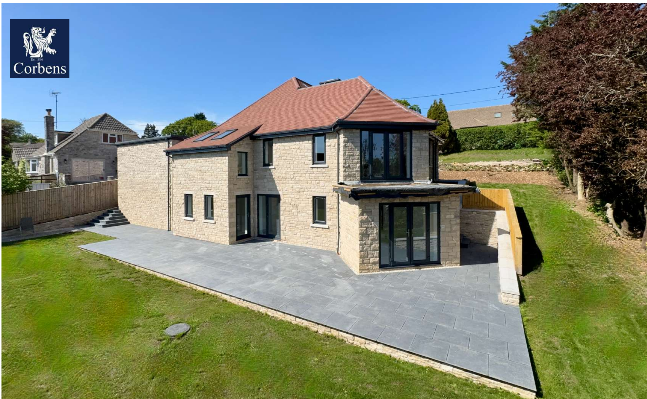
NEW HOUSE, SOUTH INSTOW, HARMANS CROSS £1,350,000 Freehold