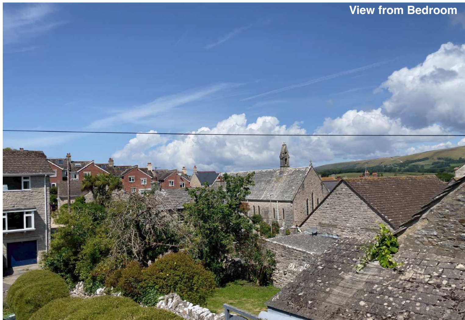
View from Bedroom

The living room, with original fireplace and beamed ceiling welcomes you to this character cottage. Beyond, the kitchen is in need of refitting, and there is access to the enclosed rear garden.