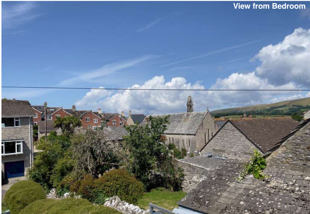
View from Bedroom

The living room, with original fireplace and beamed ceiling welcomes you to this character cottage. Beyond, the kitchen is in need of refitting, and there is access to the enclosed rear garden.