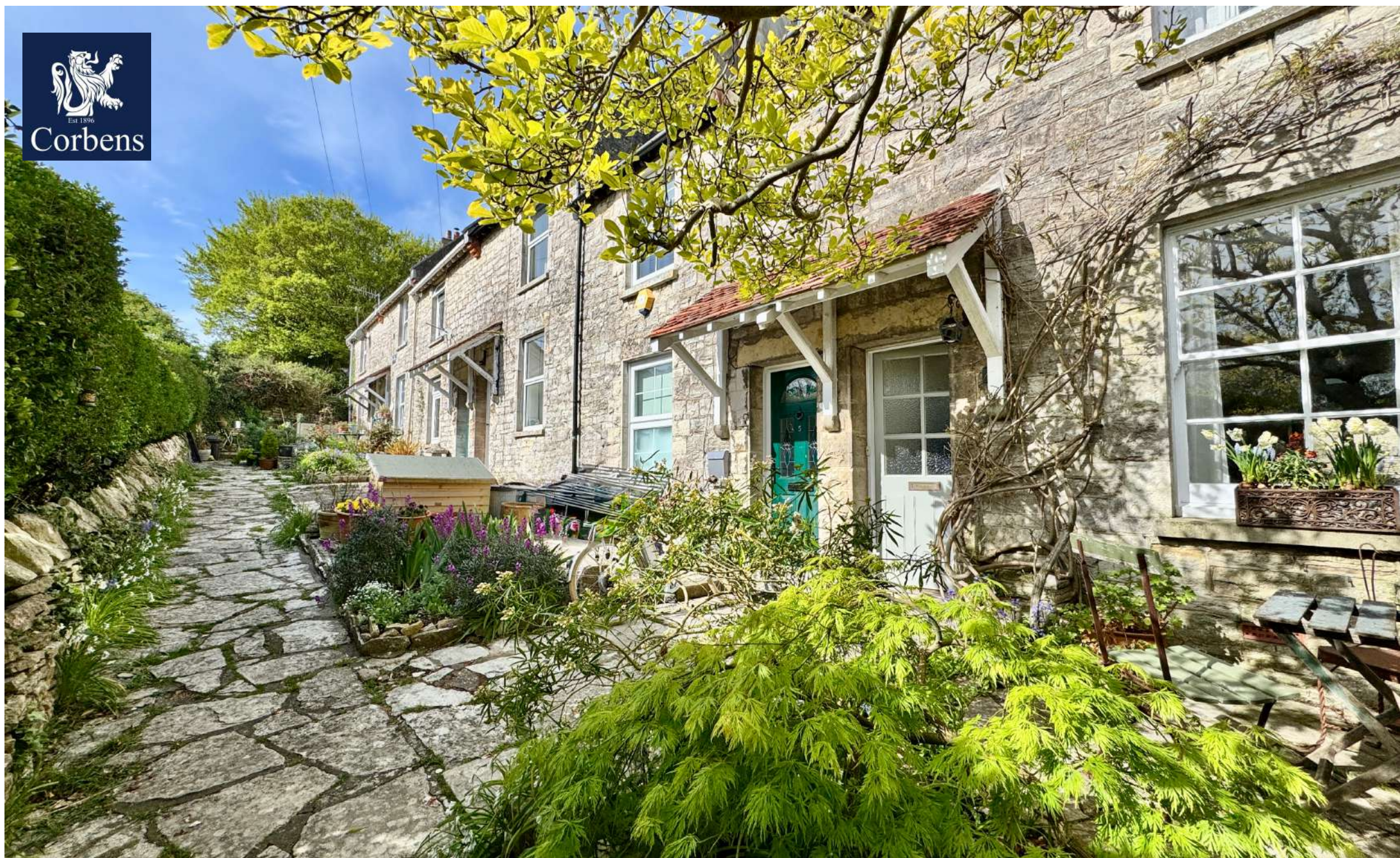
6 VICTORIA TERRACE, JUBILEE ROAD, SWANAGE £399,000 Freehold