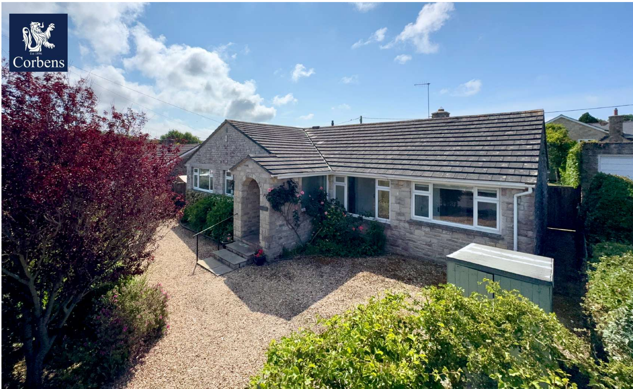
19 BATTLEMEAD, CORFE CASTLE £595,000 Freehold