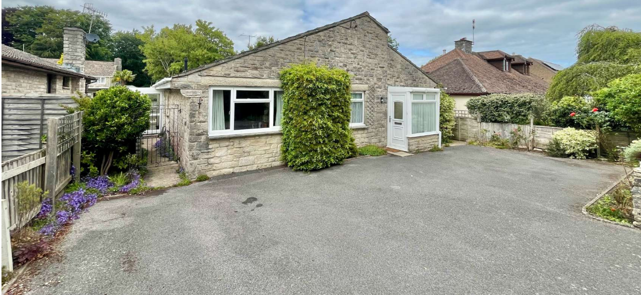
STARLINGS, HIGHER GARDENS, CORFE CASTLE £595,000 Freehold