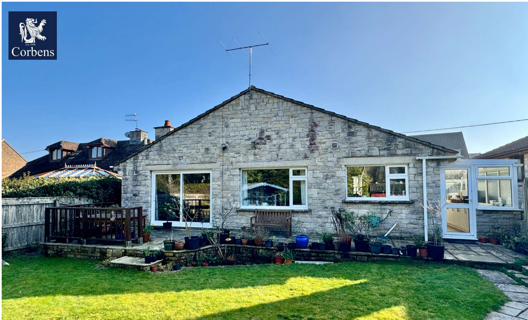
STARLINGS, HIGHER GARDENS, CORFE CASTLE £595,000 Freehold