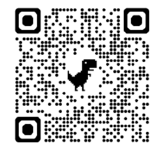
Scan to View Video Tour