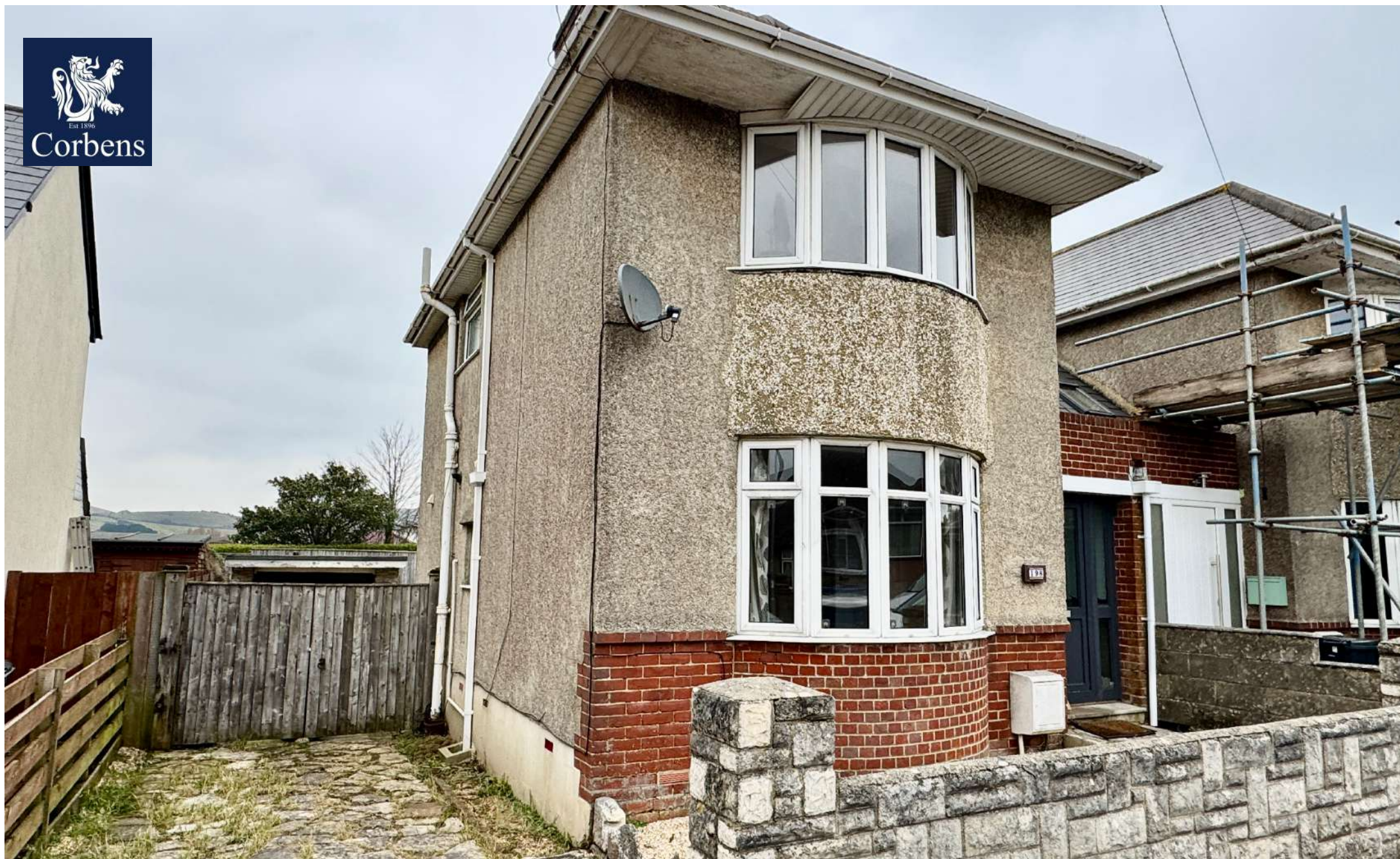
198 KINGS ROAD WEST, SWANAGE £399,950 Freehold