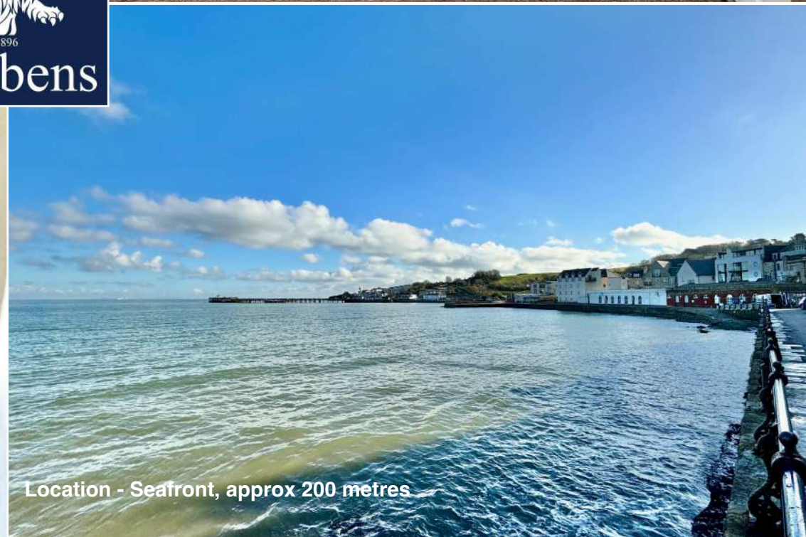
Location - Seafront, approx 200 metres