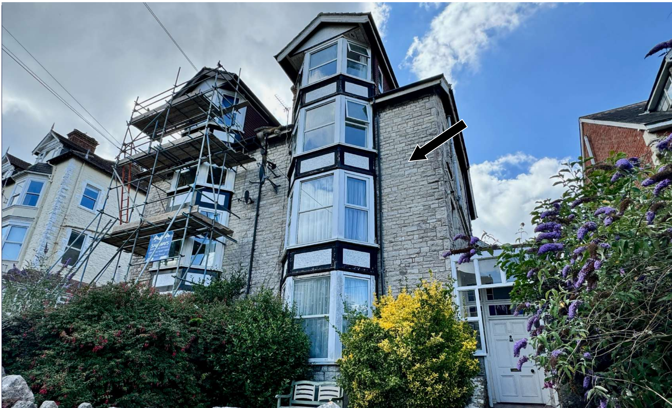
FLAT 2, 28 PARK ROAD, SWANAGE £175,000 Shared Freehold