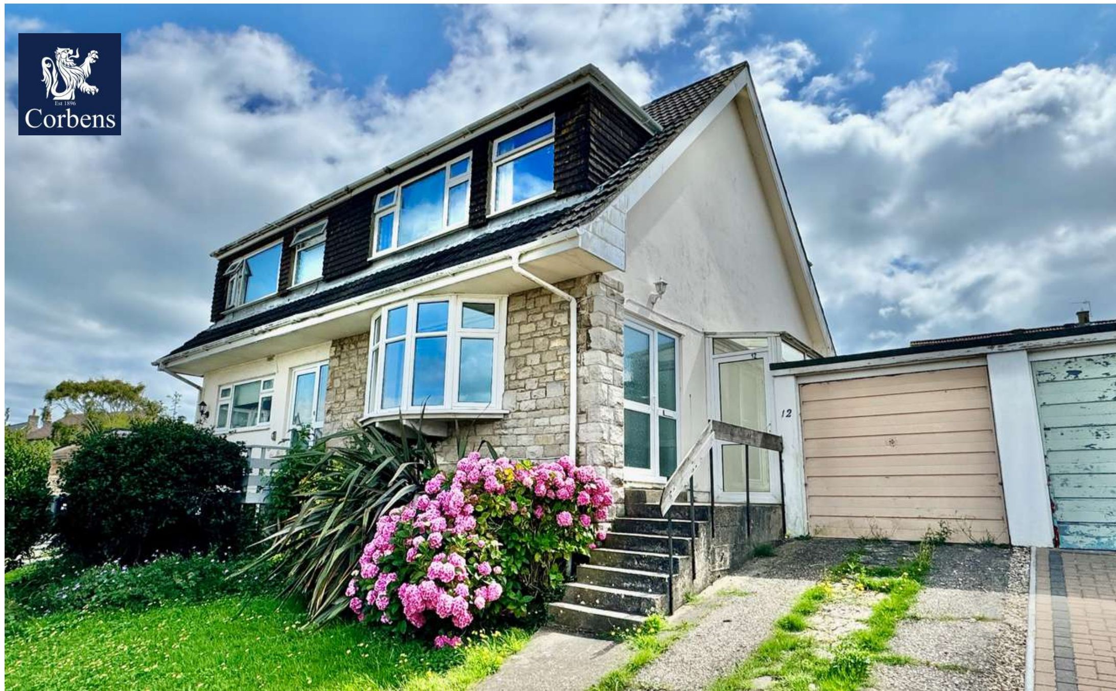
12 LEESON CLOSE, SWANAGE £349,950 Freehold