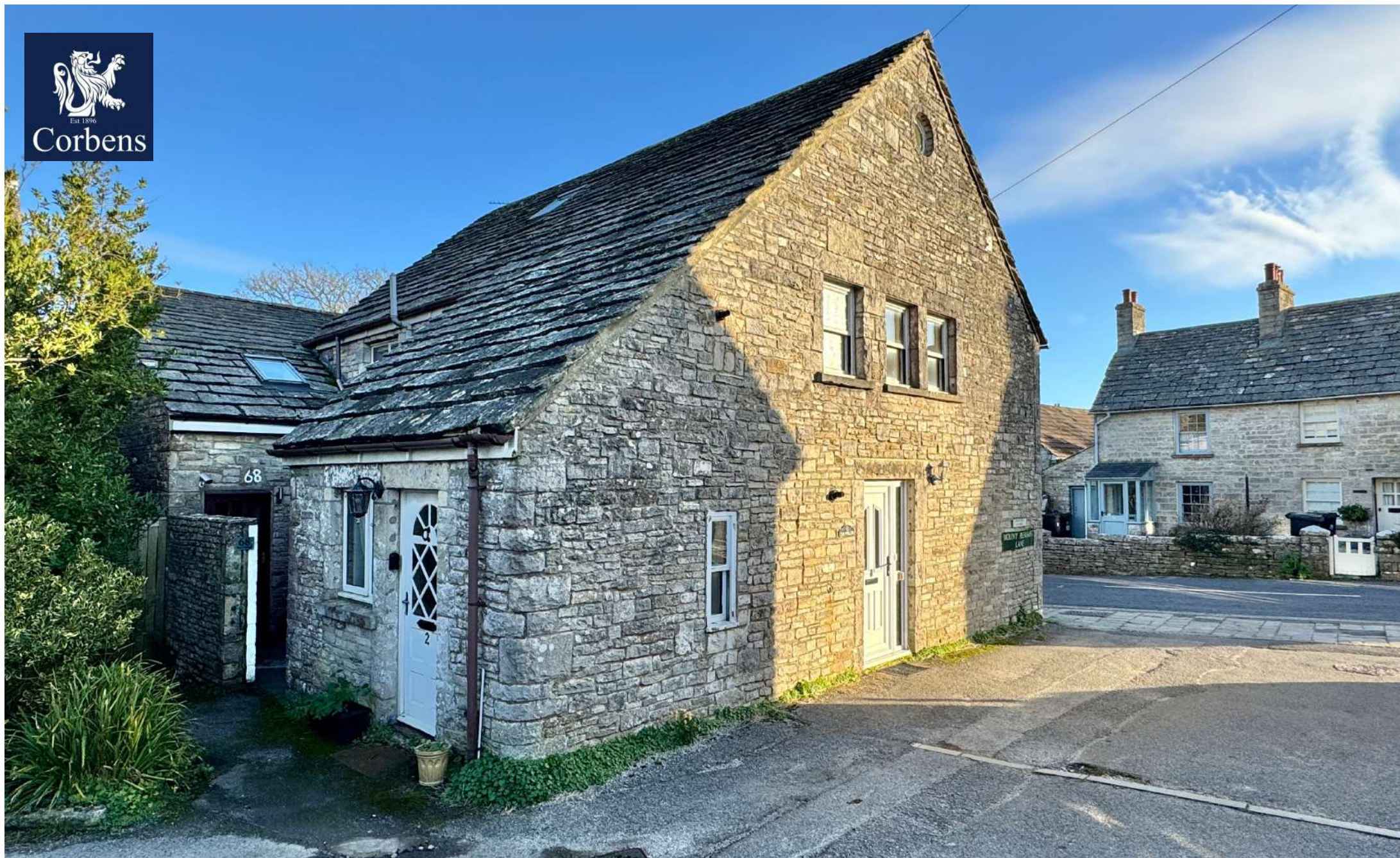
2 MOUNT PLEASANT LANE, LANGTON MATRAVERS £310,000 Leasehold