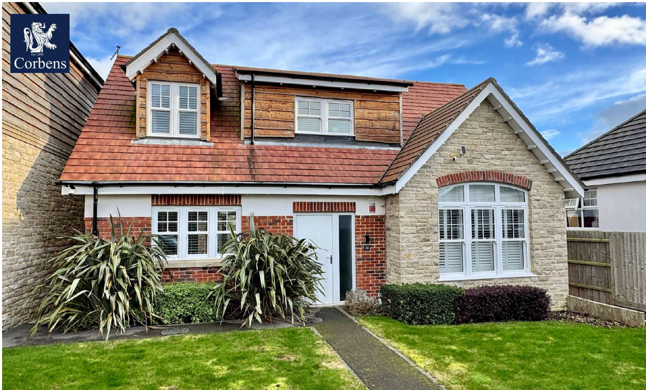
13 SMITHS FARM, SWANAGE £595,000 Freehold