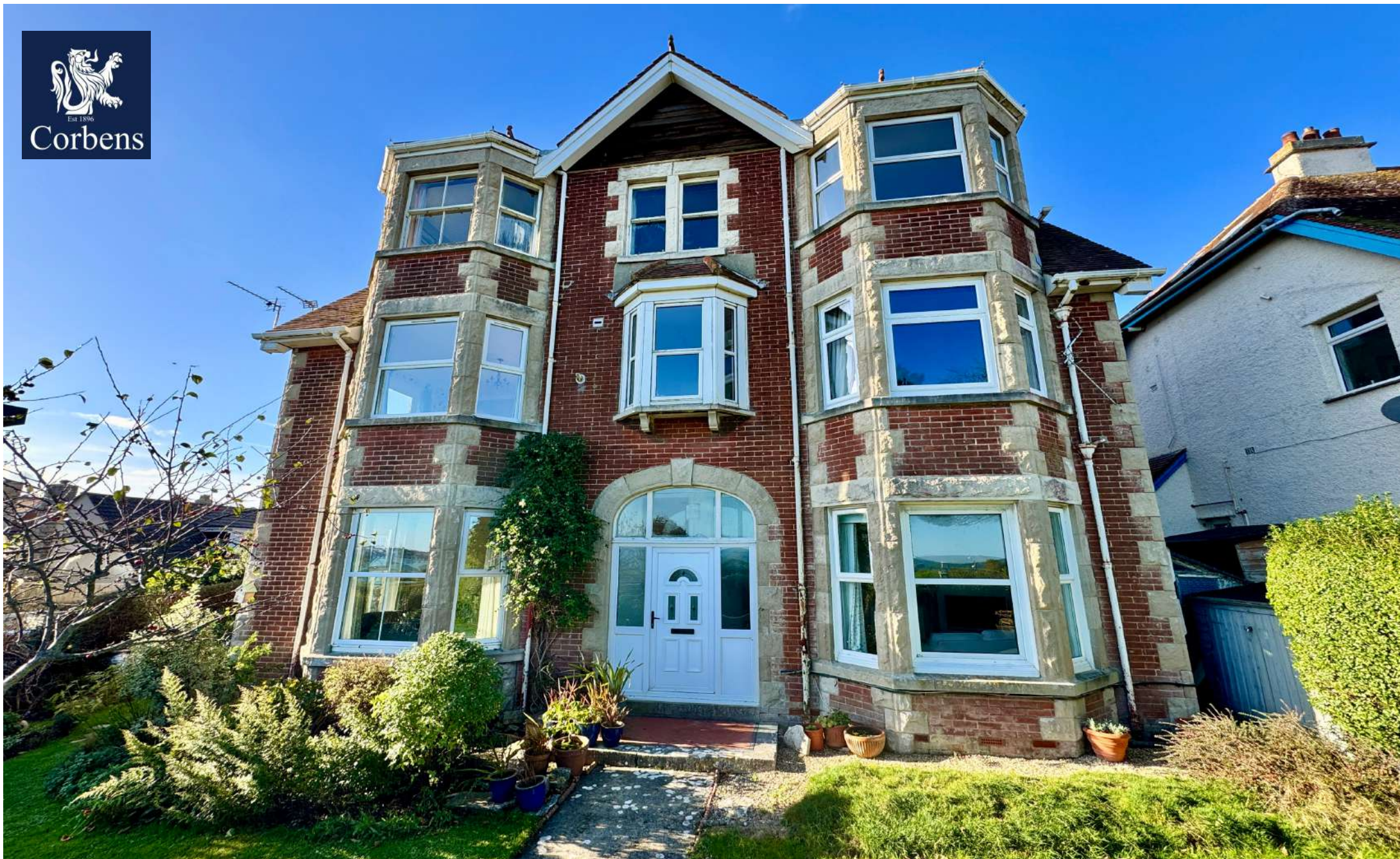
FLAT 2 BAY LODGE, DE MOULHAM ROAD, SWANAGE £250,000 Shared Freehold