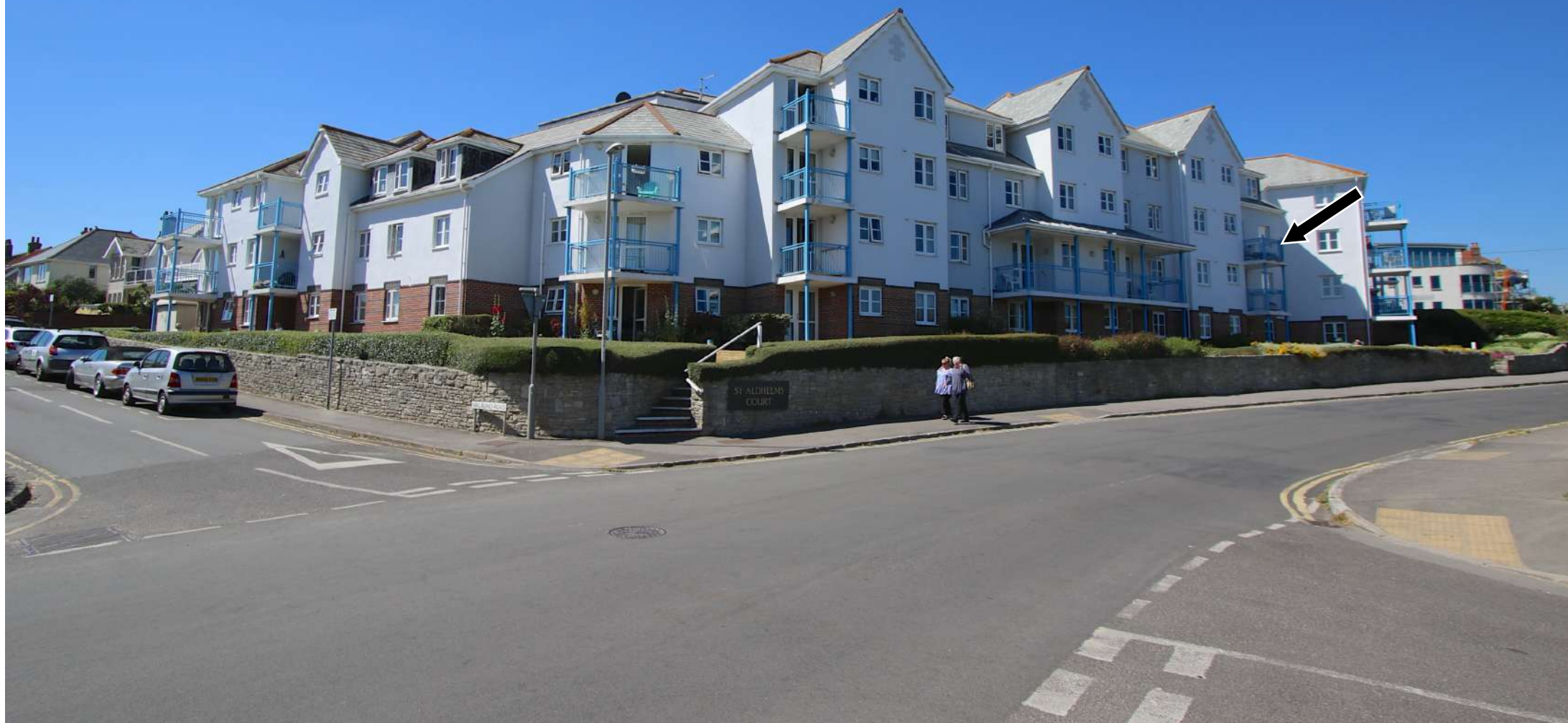
45 ST. ALDHELMS COURT, DE MOULHAM ROAD, SWANAGE £335,000 Leasehold