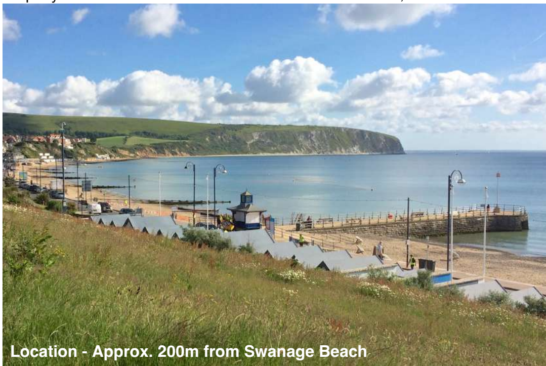
Location - Approx. 200m from Swanage Beach

PLEASE NOTE This property is owned by an employee of Corbens.