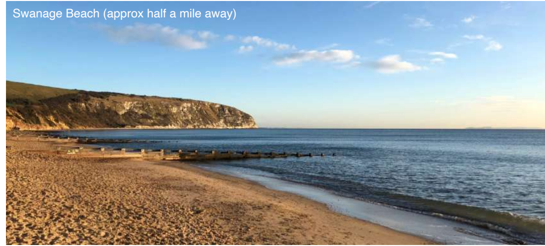
Swanage Beach (approx half a mile away)