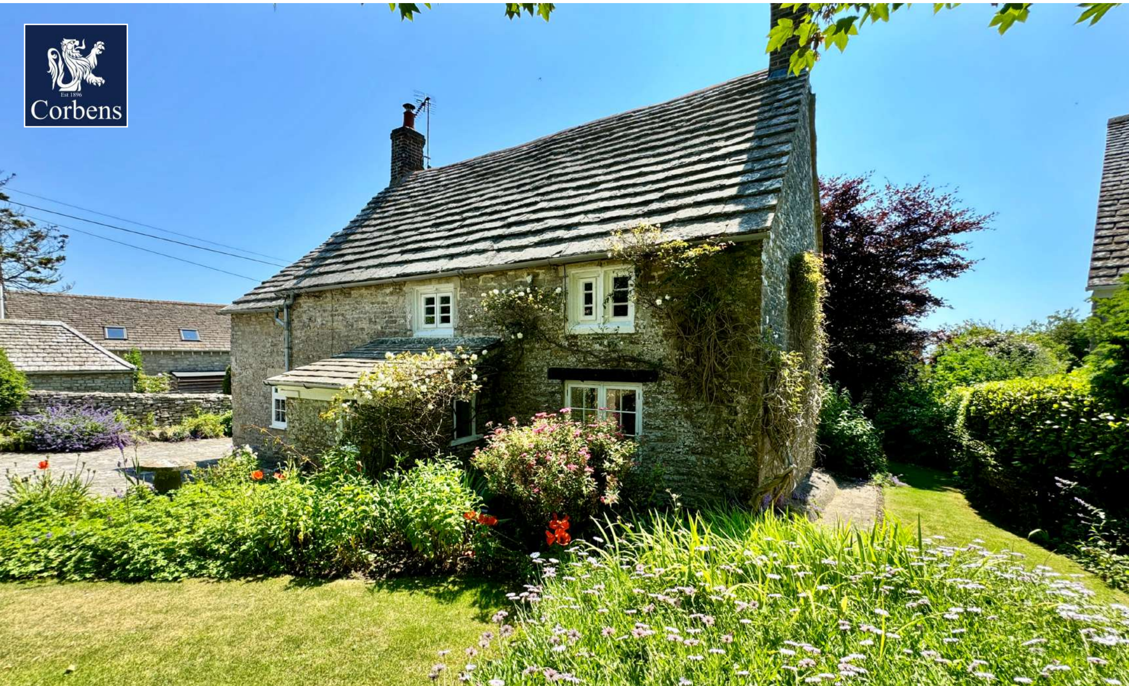
HONEYSUCKLE COTTAGE, WORTH MATRAVERS £845,000 Freehold