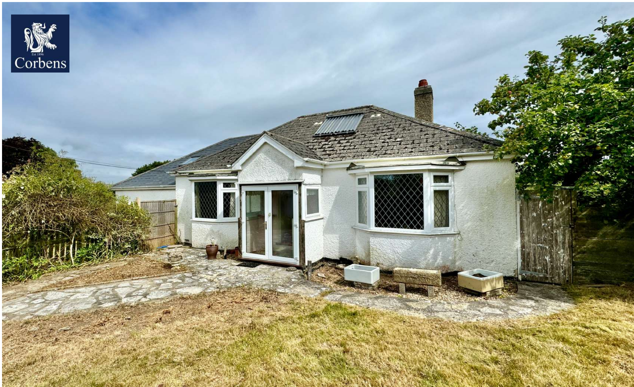
WHITE WINGS, VALLEY ROAD, HARMANS CROSS Guide £350,000 Freehold