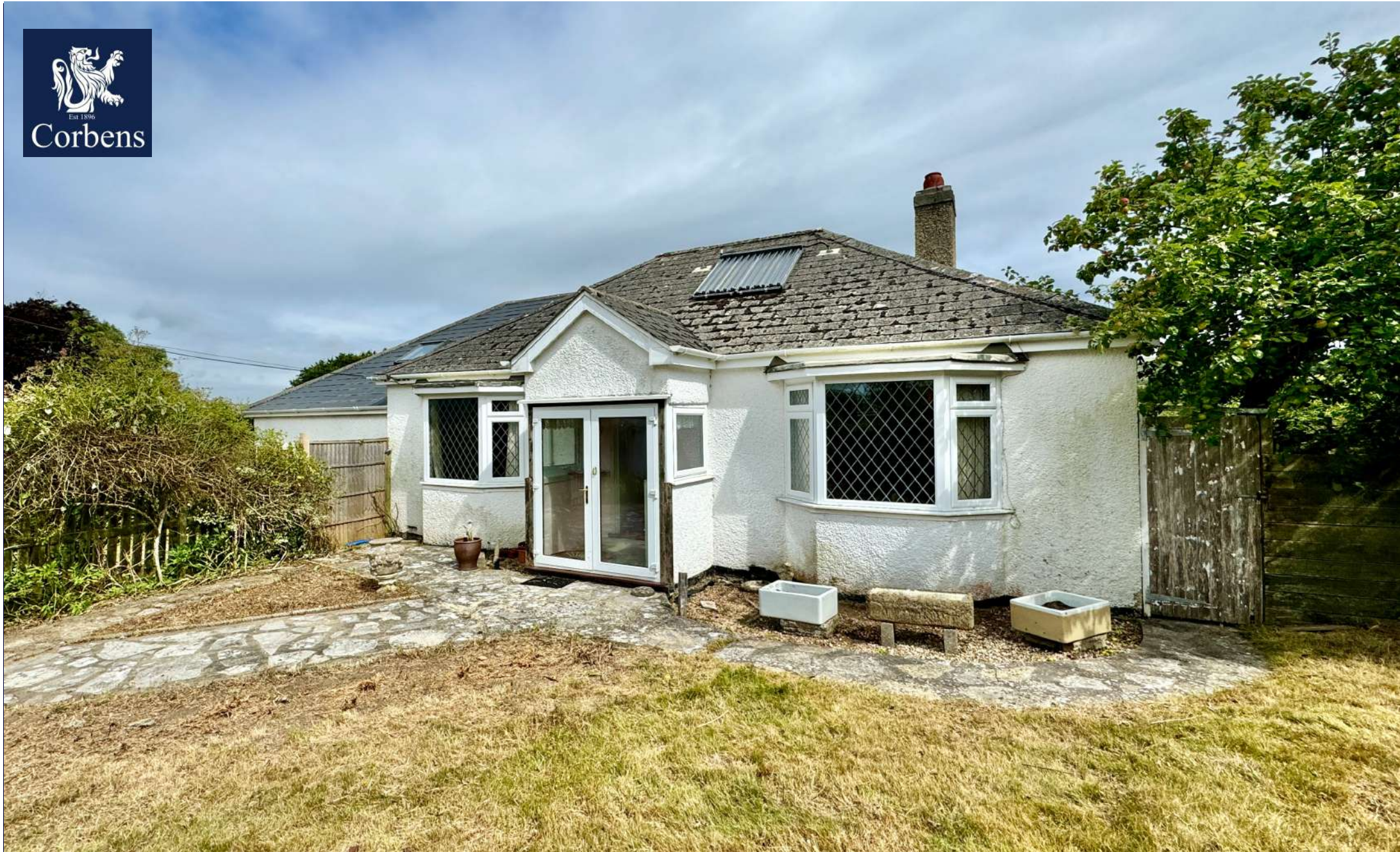
WHITE WINGS, VALLEY ROAD, HARMANS CROSS £495,000 Freehold