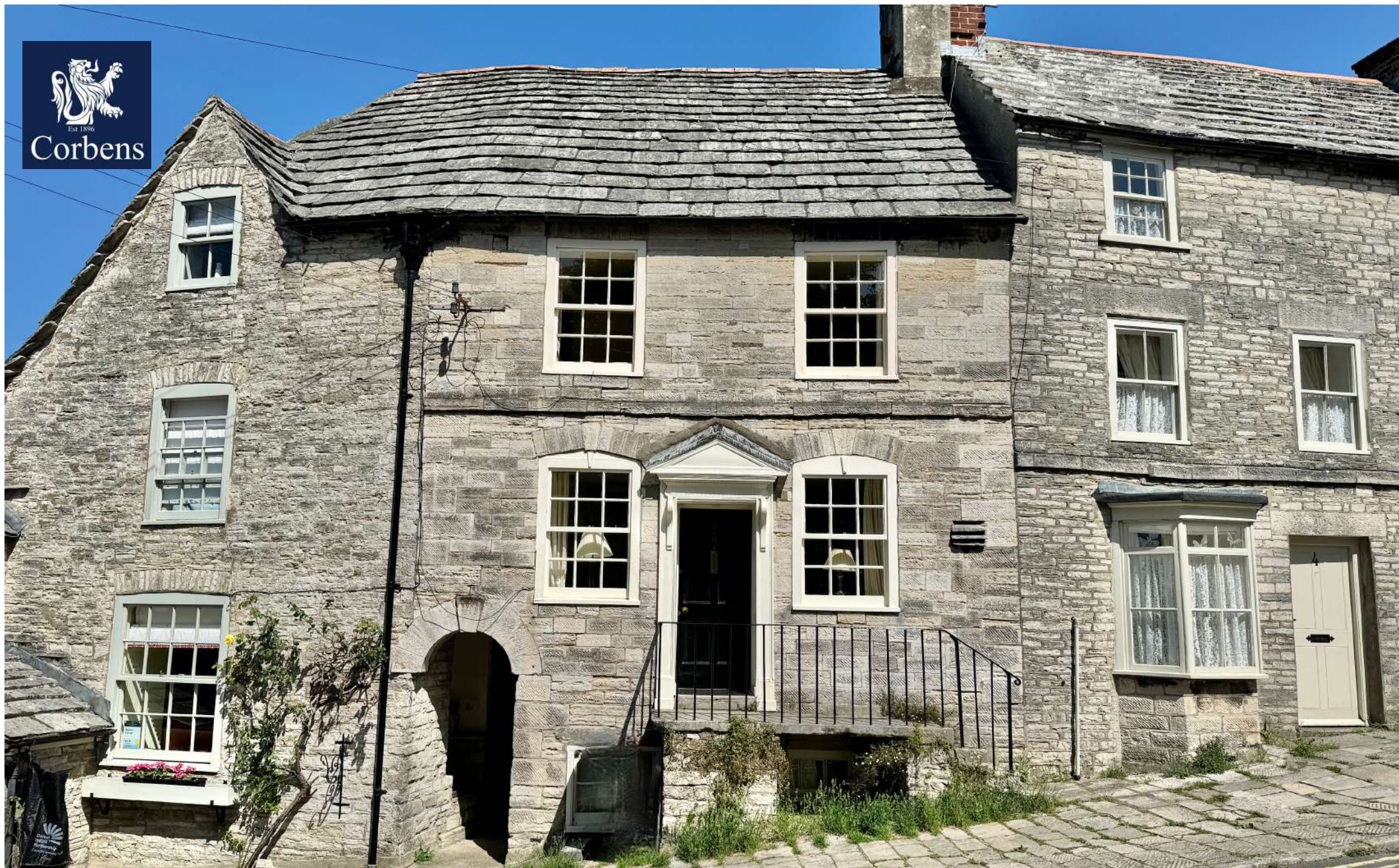
GEORGIAN COTTAGE, 6 CHURCH HILL, SWANAGE £365,000 Freehold