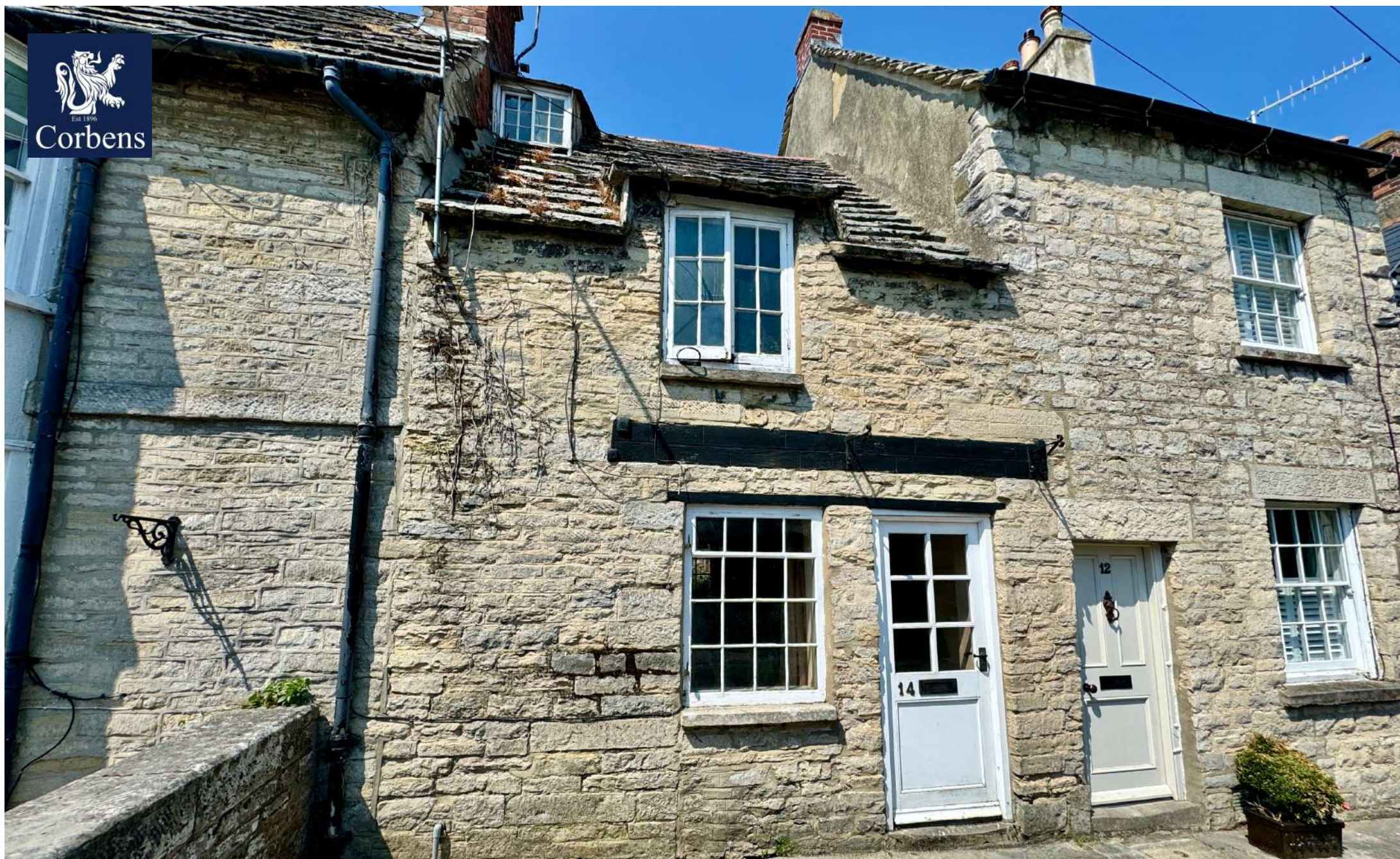
14 BELL STREET, SWANAGE £225,000 Freehold