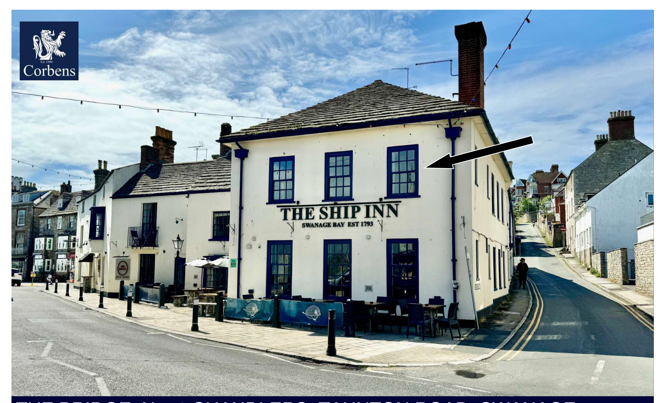
THE BRIDGE, No: 1 CHANDLERS, TAUNTON ROAD, SWANAGE £299,950 Leasehold