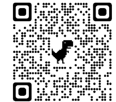
Scan to View Video Tour